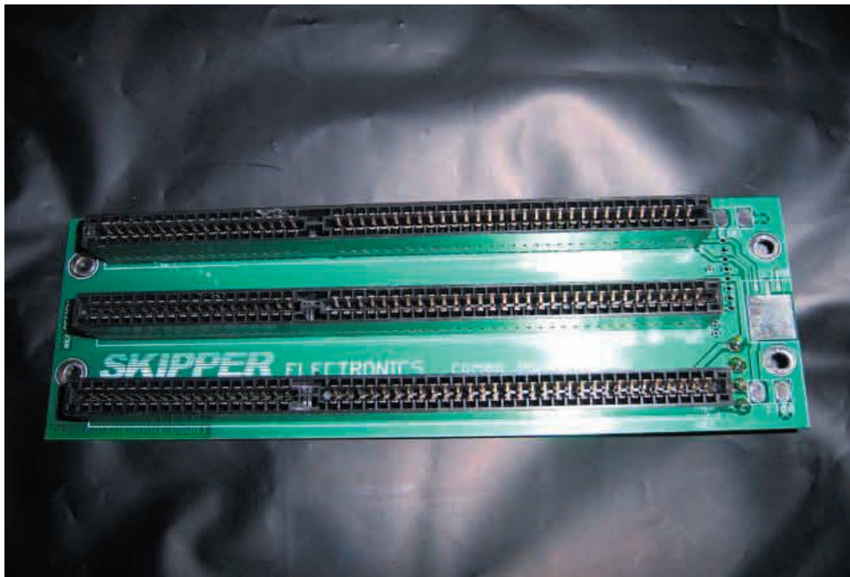
PCB Combo Motherboard ZZZ-030009