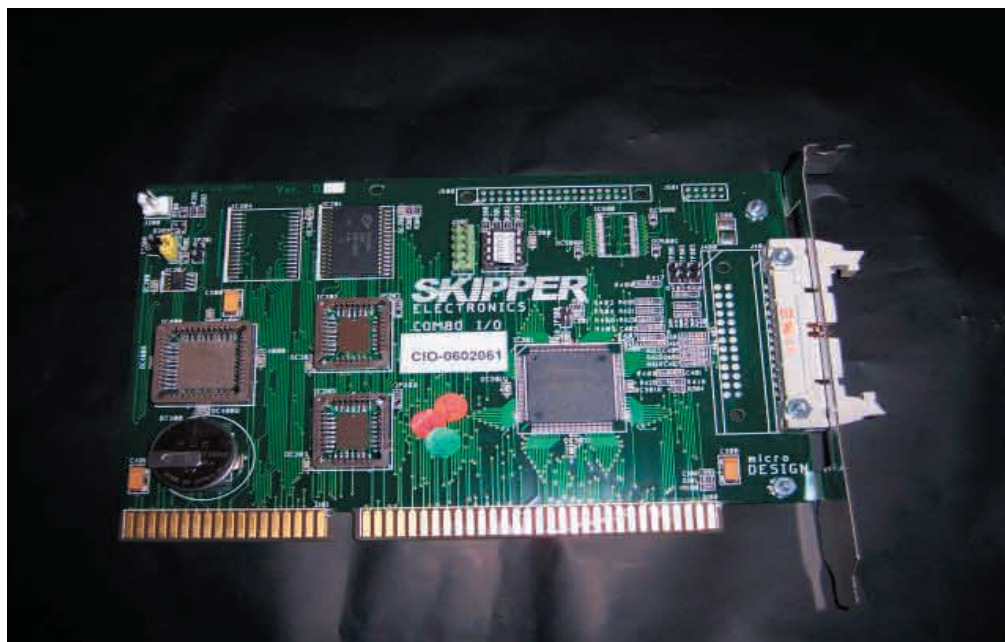
PCB Combo I/O board PI-C051