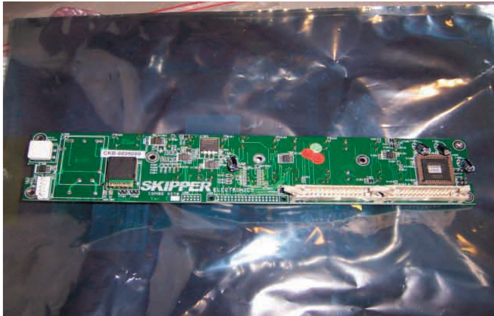
PCB Combo Keyboard PK-C002